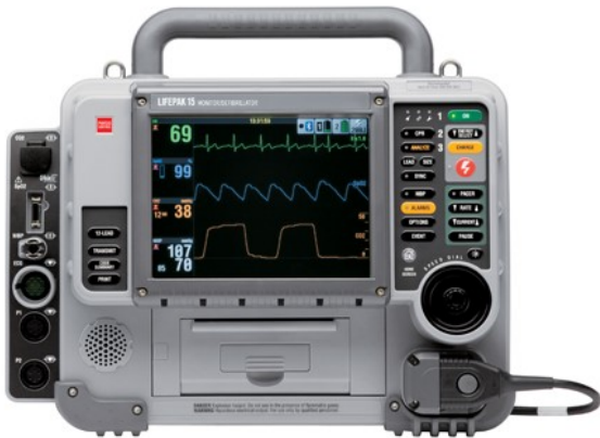
Lifepak 15 Cardiac Monitor

We have also applied for and received a donation of three (3) unused Cardiac Life AED's. These monitors will be placed in the Town Hall, the Town DPW Garage and the final one will be assigned to the Recreation Department for use at their activities and also for the use by the Town lifeguards during summer at the Green Lake Swim area.