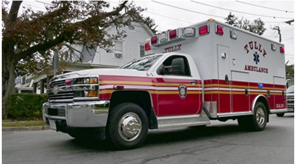
The newest addition to the Tully EMS as it appeared in the Tully Community Fair on September 12th.

Tully Ambulance District is looking for qualified volunteer ambulance drivers. Help us help you by volunteering your time to assist the residence of Tully who find themselves in need of medical assistance. The Ambulance District will be accepting applications from qualified individuals beginning October 15th. Please stop by the Tully Fire / Ambulance Station at 1 Railroad St to pick up an application, call the Fire House at 315-696-6414 or send an email to tullyfire-ems@cnyemail.com .