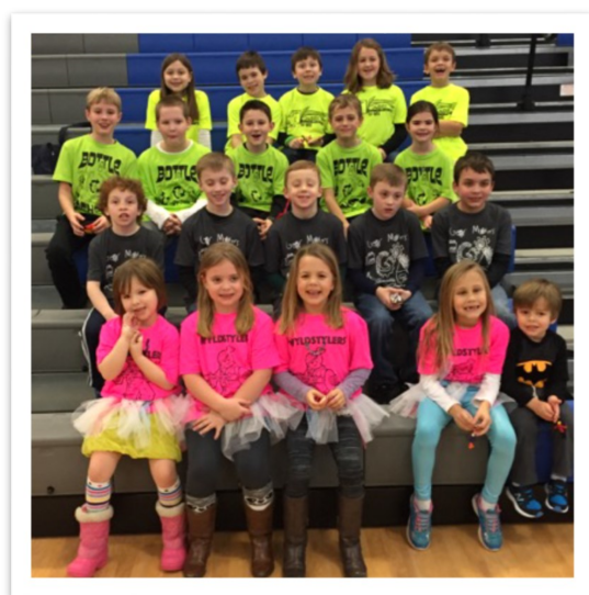
Tully Jr. First Lego League

Jr. FLL captures young children's curiosity and directs it toward discovering the wonders of science and technology. It features a real-world scientific concept to be explored through research, teamwork, construction, and imagination. Guided by adult coaches and FLL student mentors, Jr. FLL teams use LEGO blocks to build a model and develop a poster presentation to illustrate their learning. Four out of the eight Jr. FLL teams that presented at the regionals at SUNY Polytechnic Institute in Utica were from Tully. That is a tremendous showing of support for the program! Four Jr. FLL teams from Tully presented their work at the January competition at SUNY IT including the teams Gear Masters, The Master Trashers of Tully, Wildstylers and Bottle Bashers. They did a great job talking to the judges about their research and they presented moving models on the topic of "Waste Wise".