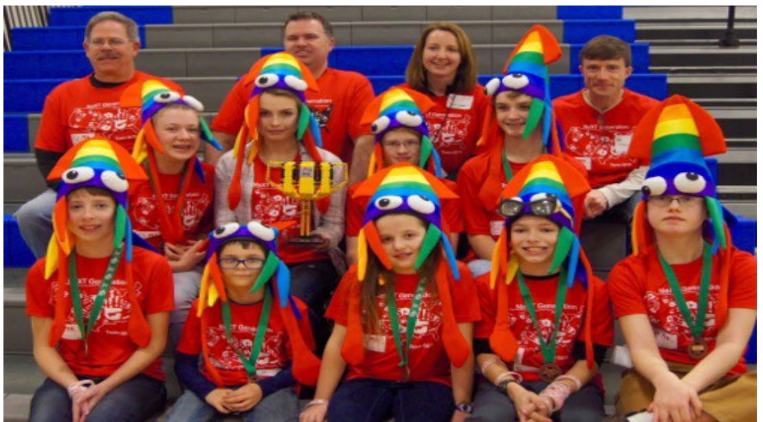
Team NeXT Generation Now Preparing to Compete at the World Championships in April!

The high school FIRST® Tech Challenge (FTC) team involves head to head competition using an exciting sports model. The team from Tully practices at both the Community Library and also at the High School. Teams design, build, and program robots to compete on a 12' x 12' playing field. Teams are randomly paired up in alliances that compete against other alliances in multiple matches, scoring points for completion of a variety of tasks. Robots are built from a reusable platform, powered by Android technology, programmed using Java and operated via remote control by team members during the matches. Teams, including coaches, mentors, and volunteers, are required to develop strategy and build robots based on sound engineering principles, such as rapid prototyping. Awards are given for the competition, as well as community outreach, design, and other real-world accomplishments. The Tully FIRST FTC team recently won the Robot Games trophy at their first Qualifier and came in second place overall at their second Qualifier. They moved on and competed in the Regional Competition.