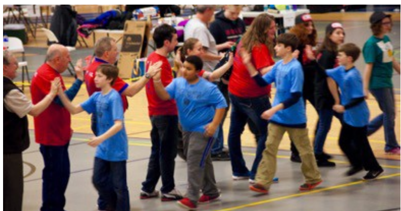
High five Team EKO Bots!

In FLL, elementary and Junior High students are immersed in real-world science and technology challenges based on an annual theme (Trash Trek this year). They identify a problem and then develop an innovative solution to that problem through research involving interviews with experts and sifting through information